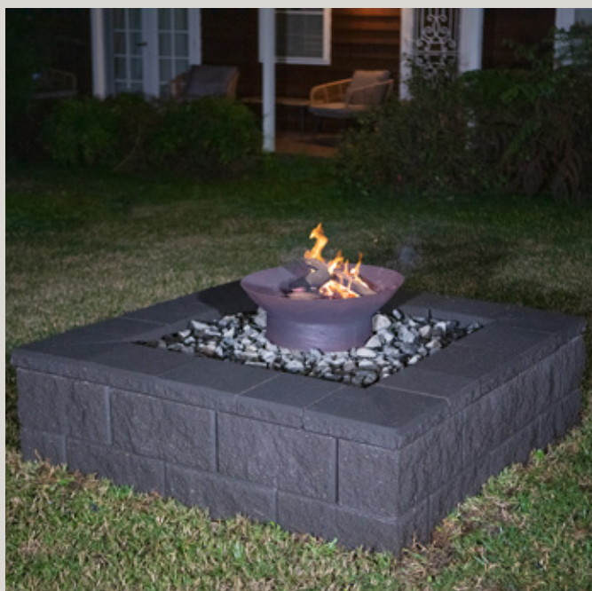
Family Friendly Fire pit - Square