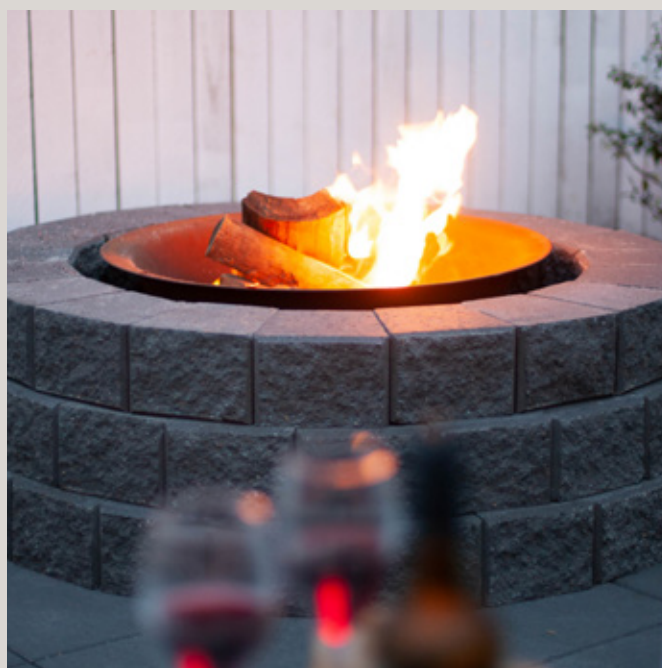
Family Friendly Fire pit - Circle