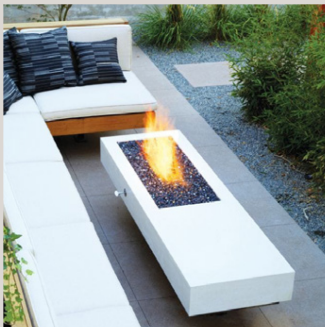
Bioethanol Fire Table