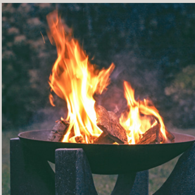
Metal fire dish